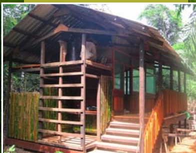
Eco-lodge by Dallas

Construction and maintenance work is constantly required in our operation, and we are very keen to welcome anyone with good DIY skills who can volunteer time with us to fill this gap.