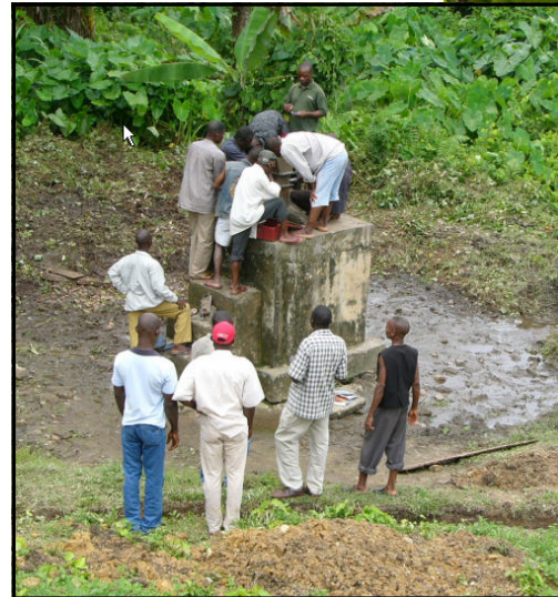
The existing borehole is at full capacity

Iko Esai is anticipating two even larger projects to start up in the coming year. Approvals have been granted for asphaltting the existing